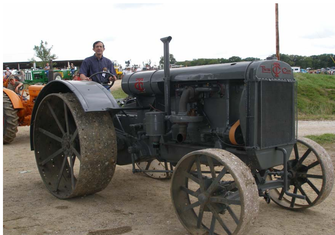
Missouri River Valley Steam Engine Association's Back to the Farm Reunion Waiting to drive in the daily Tractor Parade. September 2008