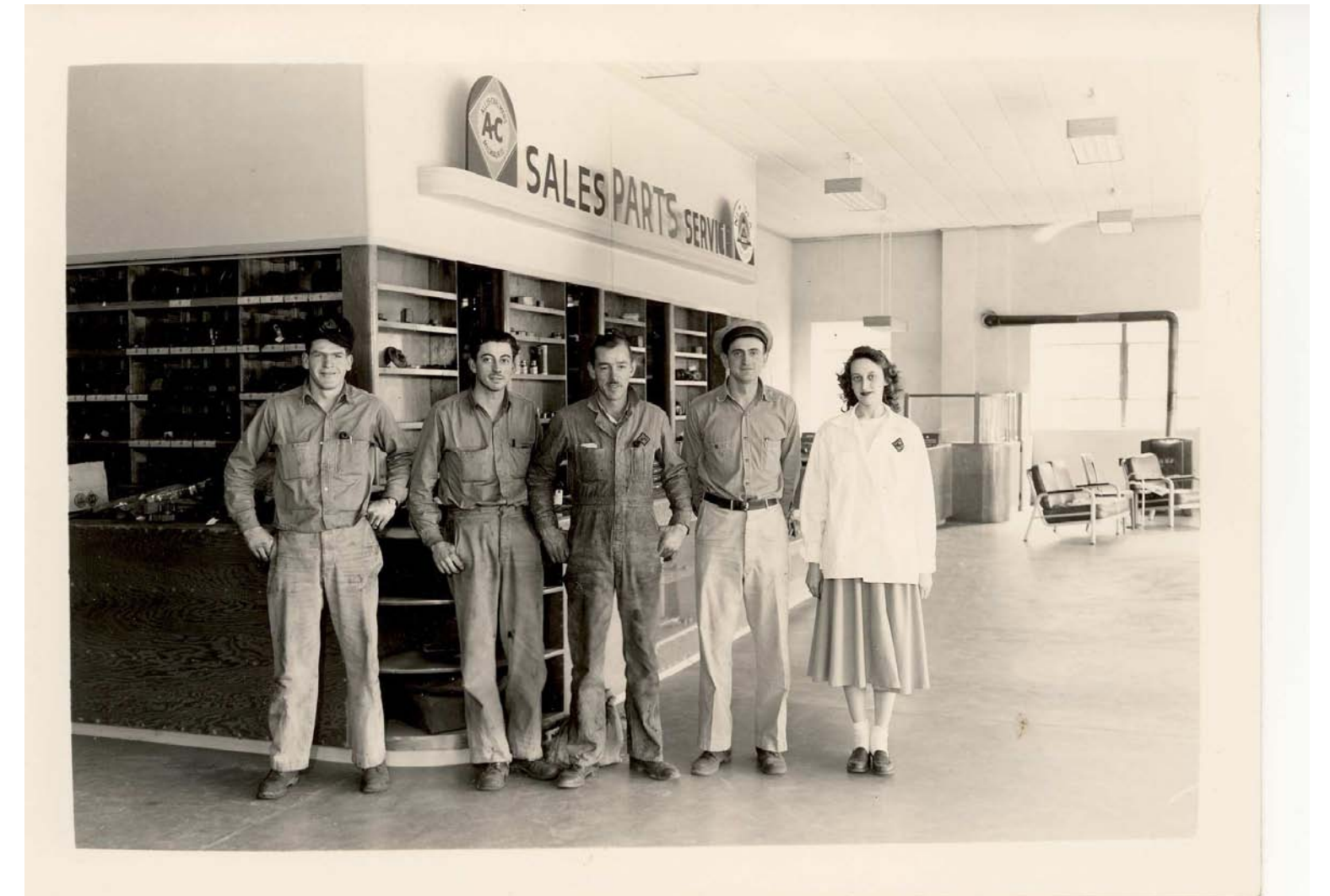
Friedrich Implement Company, Inc. Circa 1950