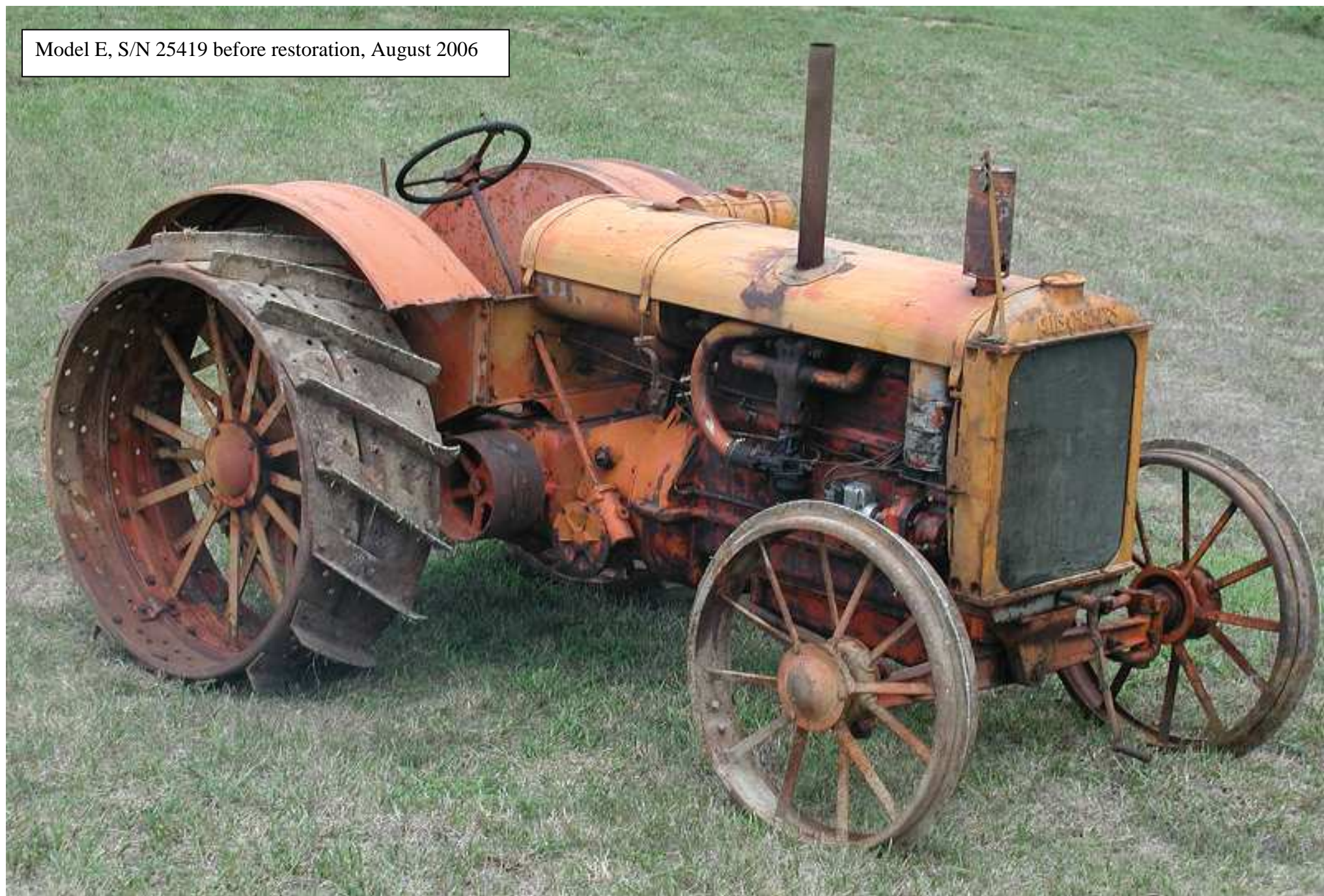
Model E, S/N 25419 before restoration, August 2006