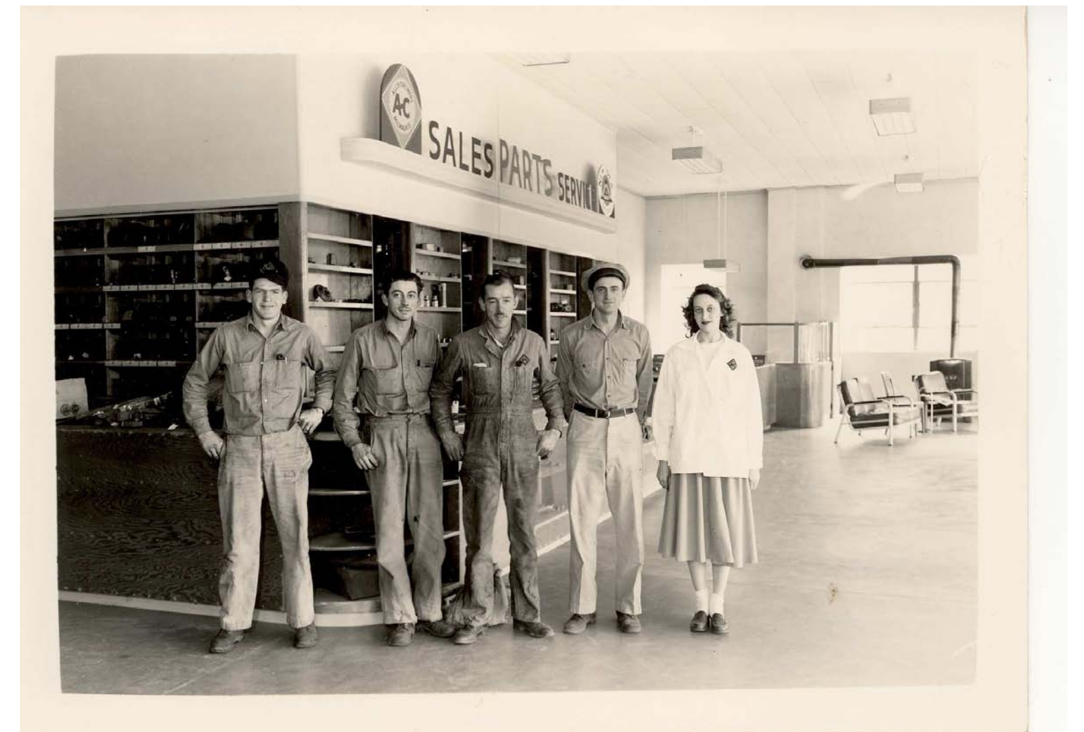
Friedrich Implement Company, Inc. Circa 1950